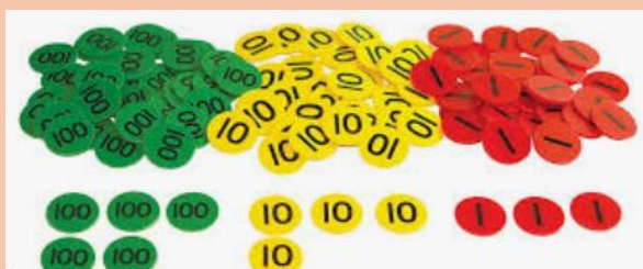
Place value counters