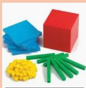
Dienes (Base 10)

This year we are working with the local Maths Hub and the National Centre for Excellence in the Teaching of Mathematics (NCETM) to integrate a mastery approach in our Maths curriculum. We will update you on our progress and arrange for some parent sessions where you can join your children to use a range of equipment and experience how a mastery approach can make Maths accessible and fun for all. As a start, here is a quick look at some of the equipment we will be using!